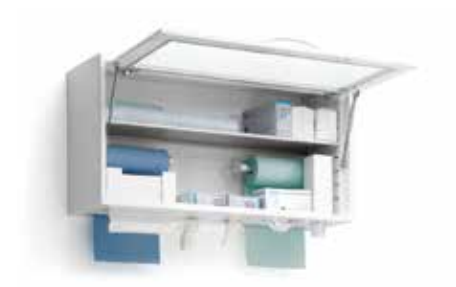
L.100 x P.30 x H.50 cm