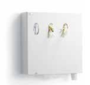
L.53 x P.13.5 x H.53 cm

The new PDM cabinet comes from the need to group disposable hygiene products together in special and functional distributors. Equipped with practical compartments, the PDM is also supplied with a practical aluminium shelf for glove, glass and mask stock. The door has a plexiglass insert. The simple, but elegant design organizes and furnishes your dentist's office.