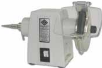
item: 326/00 - LUX-OR