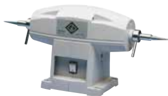
item: 320/00 - MAP-1