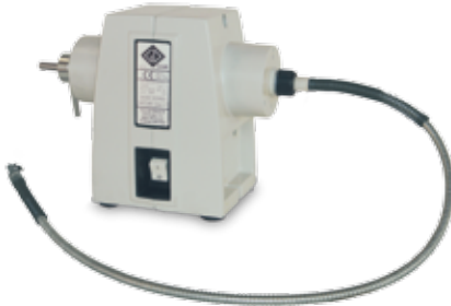
item: 325/00 - LUX-FLEX