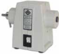
item: 324/00 - LUX-1 SX