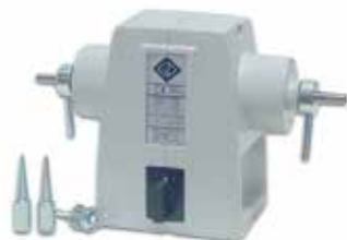
item: 322/00 - LUX-2