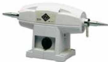
item: 330/00 - MAP-2