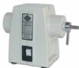
item: 323/00 - LUX-1 Dx