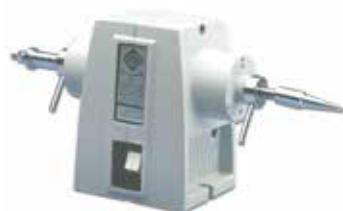
item: 321/00 - LUX-1